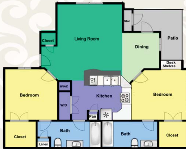
B1 Two Bedroom / Two Bath 1,035 Sq. Ft.*