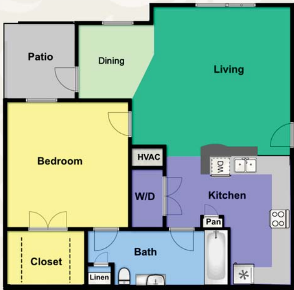
A1 One Bedroom / One Bath 750 Sq. Ft.*