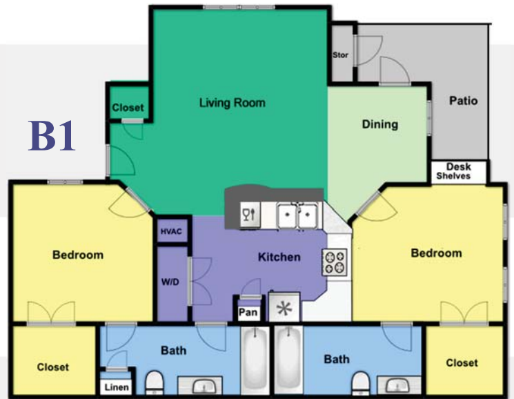
2 Bed / 2 Bath 1,035 Sq. Ft.*

2509 East Hubbard, Mineral Wells, TX 76067