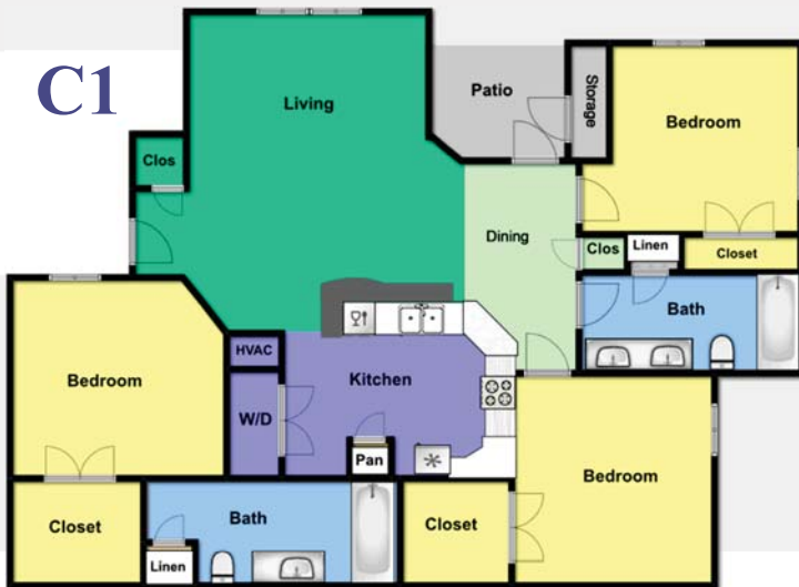
3 Bed / 2 Bath 1,200 Sq. Ft.*