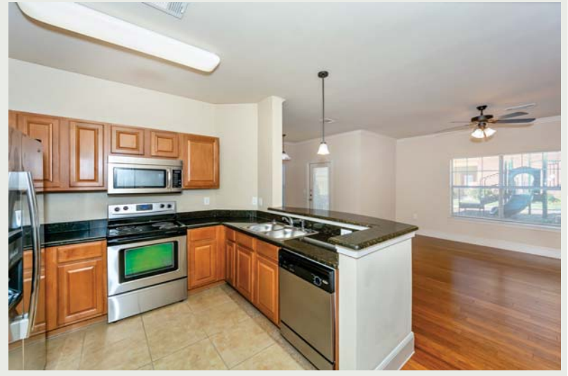
1 Bed / 1 Bath 750 Sq. Ft.*